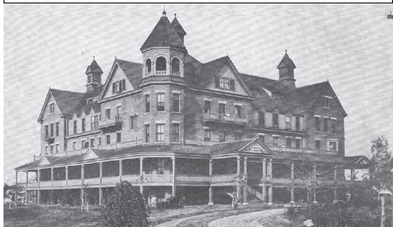
The Haskell Home—Battle Creek, Mich.